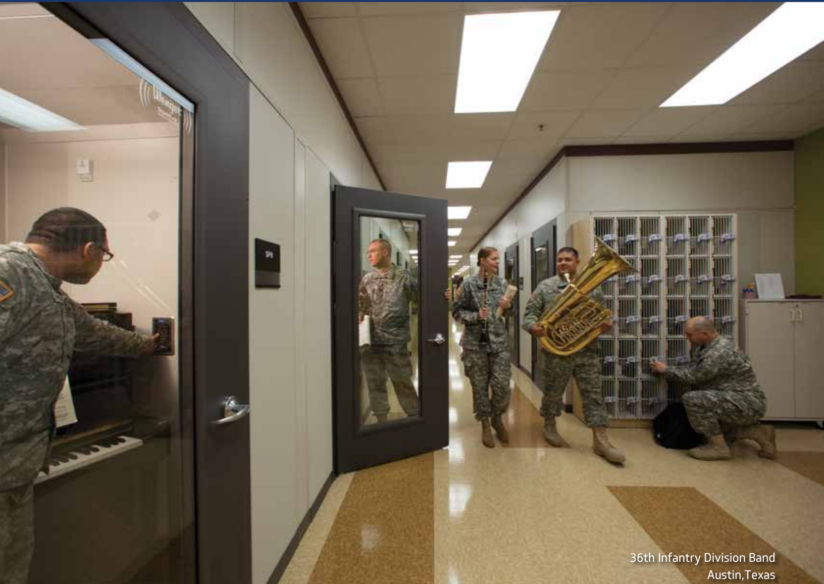
36th Infantry Division Band Austin, Texas