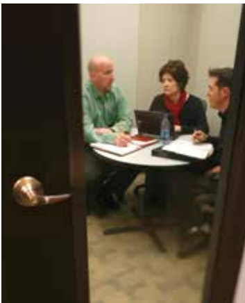
PRIVATE CONFERENCE ROOMS