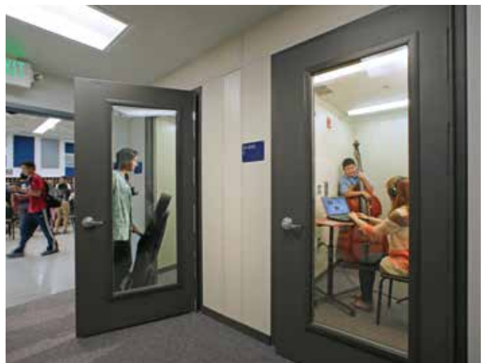
Wenger Sound-Isolation Rooms used as Music Practice Space - Walnut High School, Walnut, California