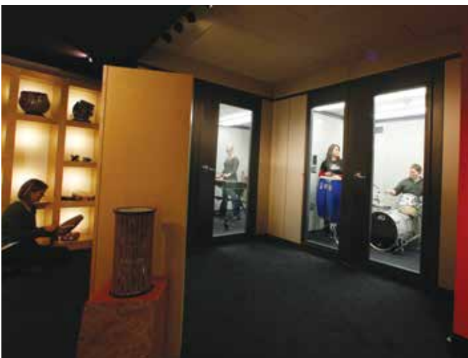
Wenger Sound-Isolation Rooms used as Museum Experience Space - Percussive Arts Society, Indianapolis, Indiana