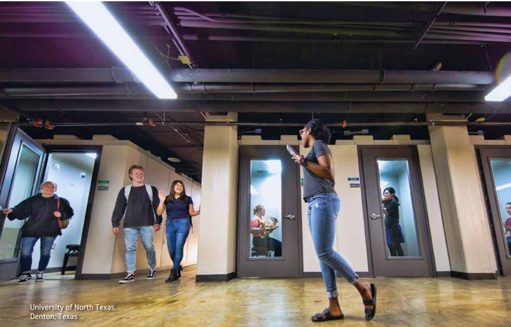
University of North Texas, Denton, Texas