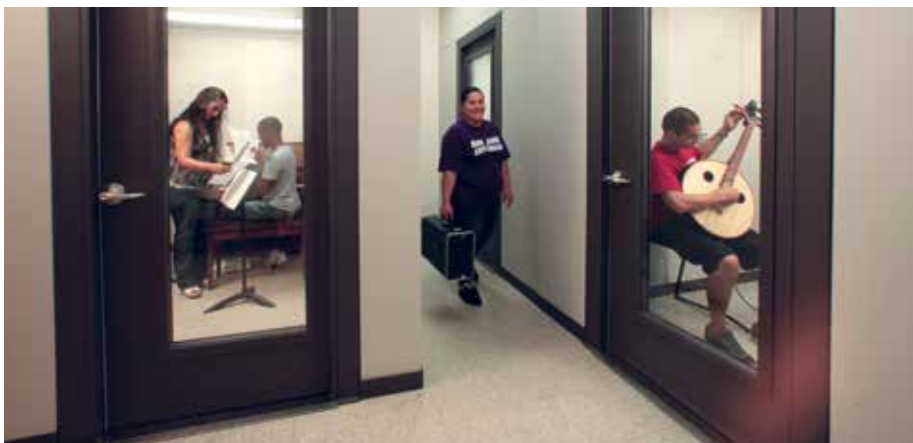
Wenger Sound-Isolation Rooms used as Music Practice Space - San Jose City College, San Jose, California